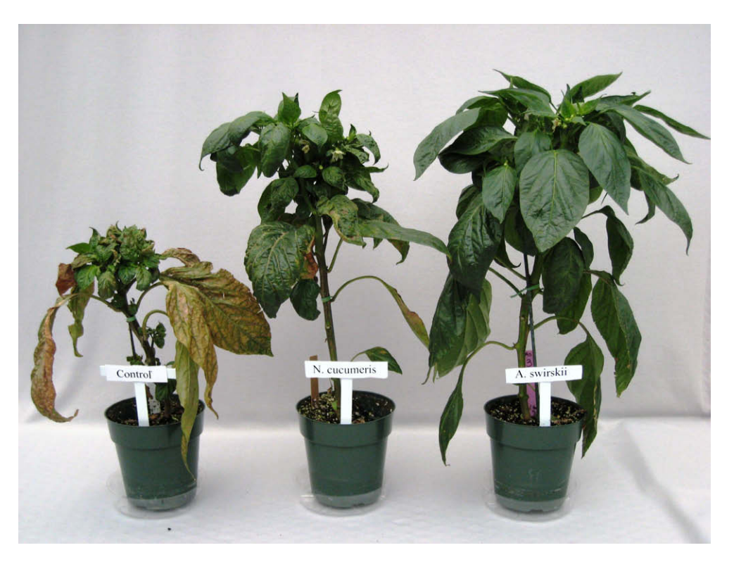
Fig. 2. Greenhouse grown sweet pepper 35 days after infestation with S. dorsalis (30 adults per plant) and 28 days after release of predatory mites (30 adults per plant).